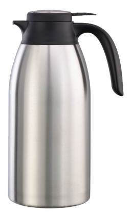
FCC20SS Brushed 2 Liter