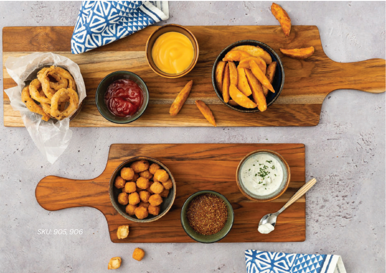
SKU: 905, 906